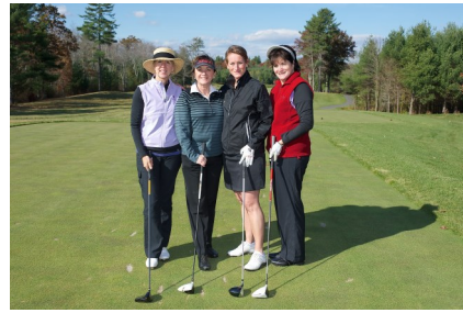
Representatives from Boston Private (above) & Liberty Mutual (below) enjoying the day at TPC Boston